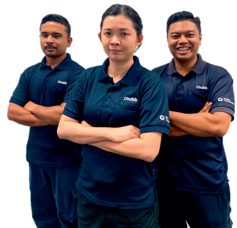
Chubb Qualified Service Professionals

Best engineering practices are employed starting with our team of highly trained Design Engineers and BIM Modellers whom we invest in to ensure latest and up-to-date technical skills & competencies.