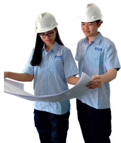
Chubb Professional Design Team