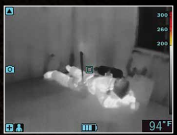
For use with lower temperature situations, such as initial rescue efforts after traffic accidents, searches in wooded landscapes, etc.