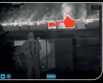
Used for finding hotspots. The hottest 20% of the scene is colored in red.