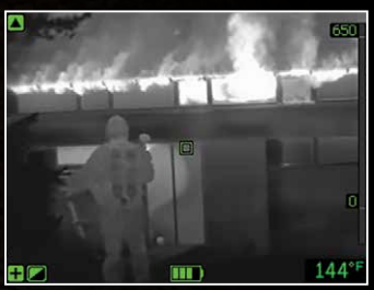
Same as the TI Basic mode but a grey scale image