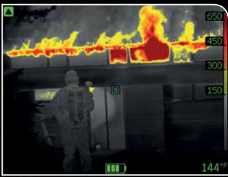
For initial fire attack and life rescuing operations